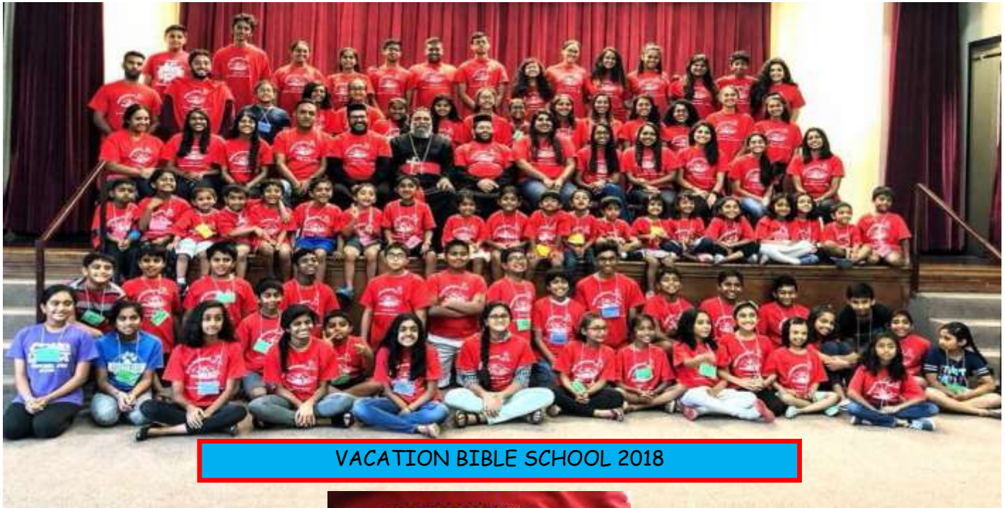
VACATION BIBLE SCHOOL 2018