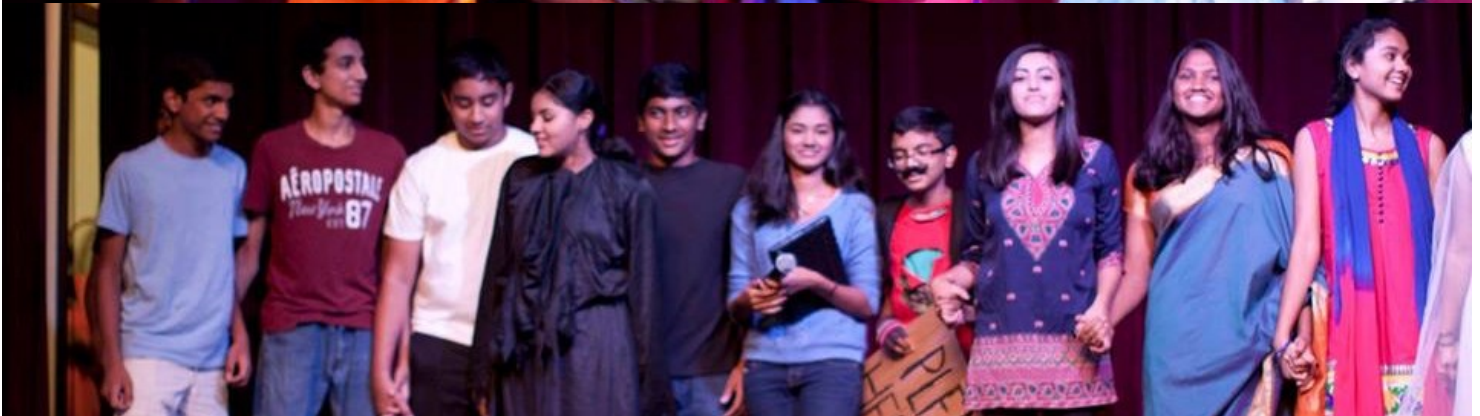
9th and 10th Graders