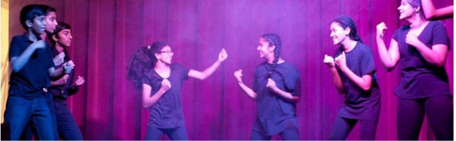
7th and 8th Graders