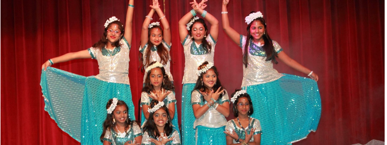
4th 5th and 6th Graders