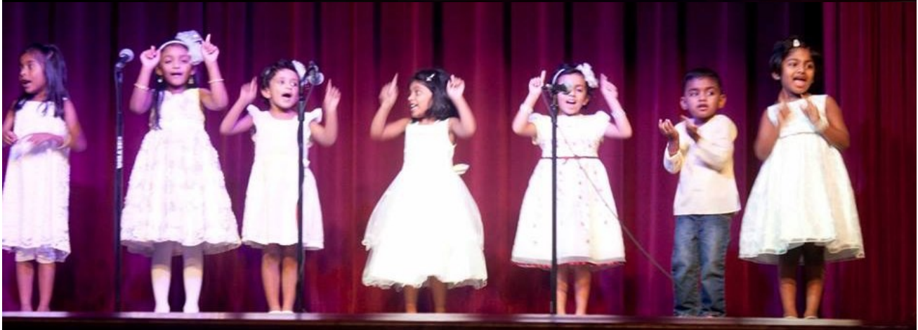
Prek and Kindergarten