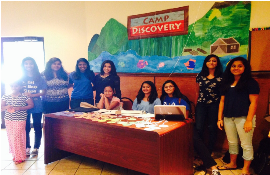
Praise and Worship