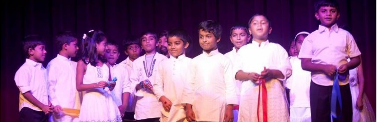
1st 2nd and 3rd Graders