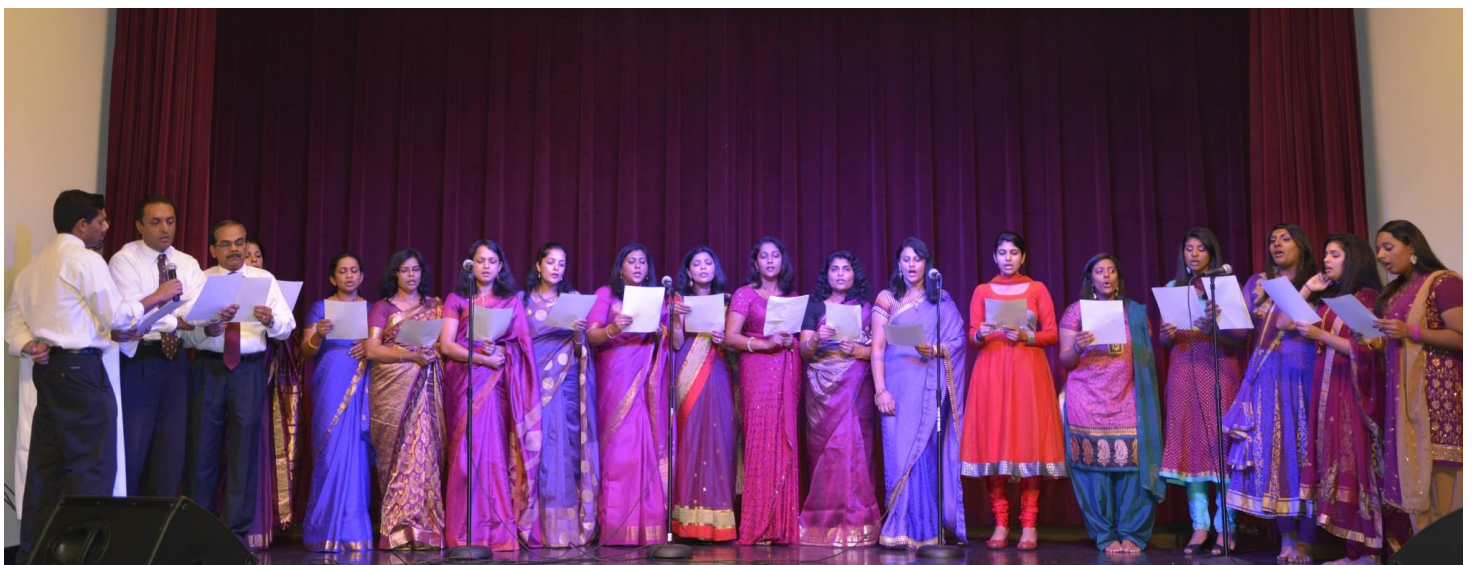
Group Song by SundaySchool Teachers