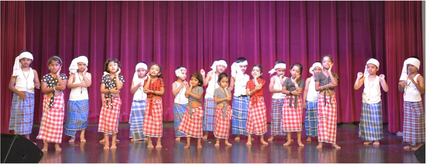
"Mukkuva Dance" by PreK, KG & 1st Graders