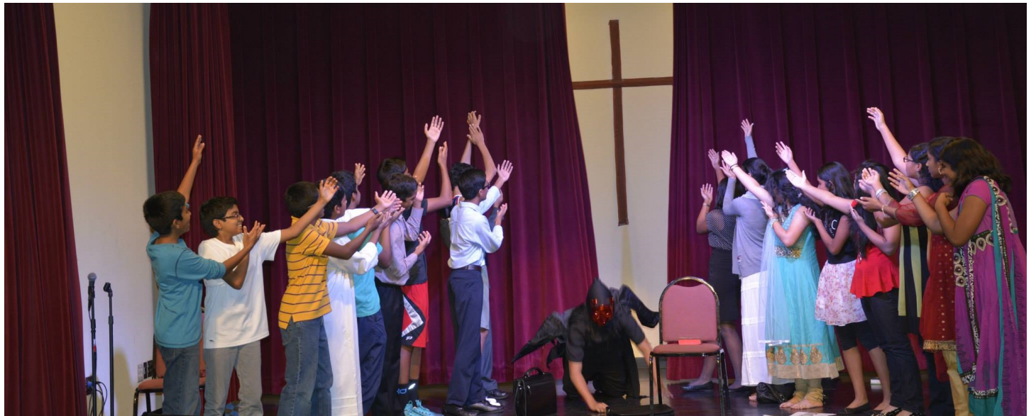
Sin Chair Skit by 7th,8th & 9th Graders