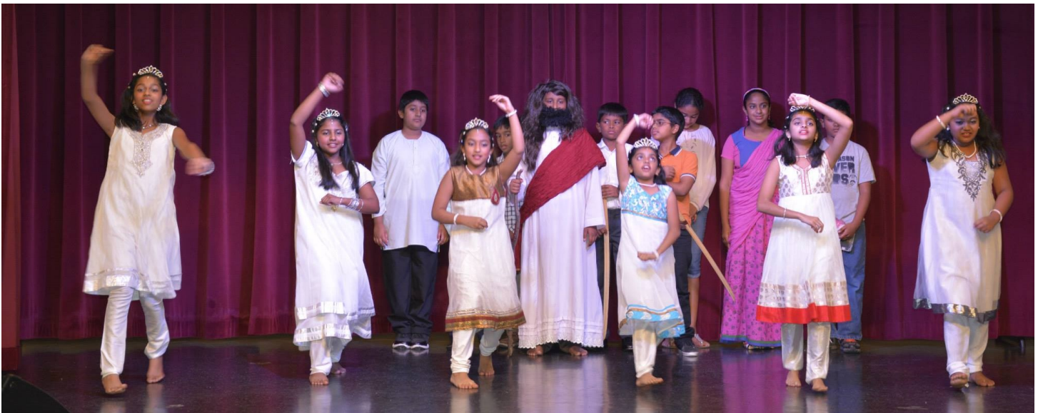
Ten Commandments Musical Skit by 4th, 5th & 6th Graders