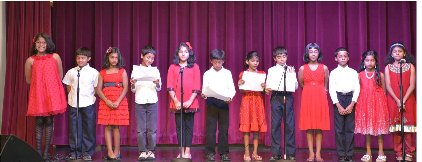
Group Song by 2nd & 3rd Graders