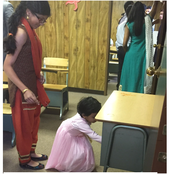
I got this...